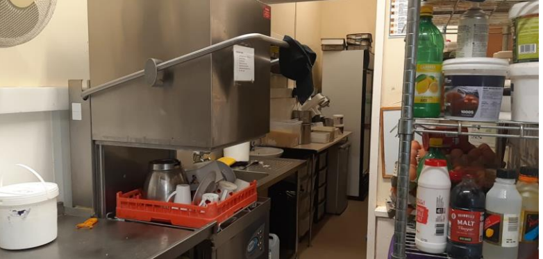
Front Severy/Preparation Area with a large range of equipment.